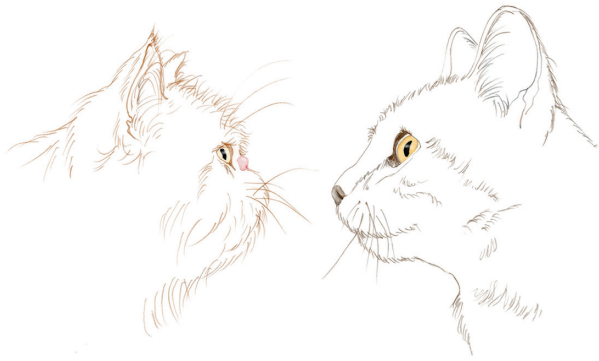
Figure 1 —Illustration of the facial profile of a brachycephalic cat (left) in comparison to a domestic shorthair cat (right). Along with the flattened facial silhouette of brachycephalic cats the external nose also is smaller than other cat breeds’.