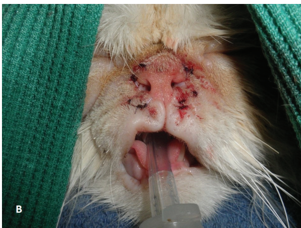
Figure 3 —Perioperative images of a Himalayan cat from the case series described in Figure 2 before (A) and after (B) corrective surgery. In this cat, the right rostral upper margin of the lip was slightly lifted following closure of the lower punch incision; this had no clinical consequence.