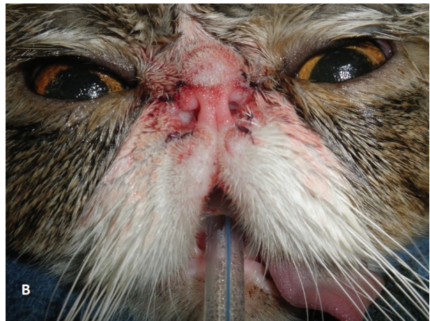
Figure 4 —Perioperative images of a Persian cat from the case series described in Figure 2 before (A) and after (B) corrective surgery. Note the enlargement of each nostril opening with this simple technique.

Elizabethan collars were placed on each cat during anesthetic recovery. All cats recovered from anesthesia uneventfully and were discharged later in the afternoon with instructions to keep the collars on each cat for a minimum of 1 week. Each cat was discharged with a prescription of buprenorphine (0.02 mg/kg, PO) every 12 hours for 5 days.