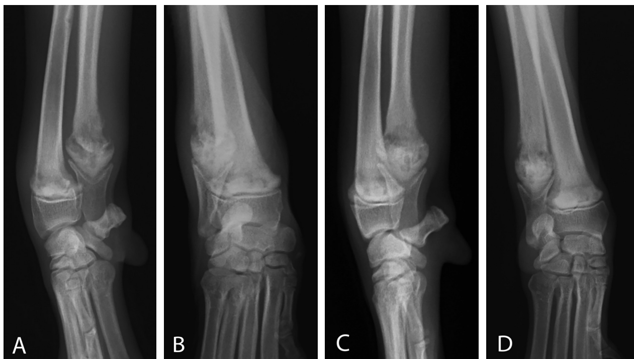
Figure 1 —Lateral (A and C) and craniocaudal (B and D) radiographic views of the distal aspect of left (A and B) and right (C and D) antebrachia of a 4-month-old sexually intact female mixed-breed dog examined for a 5-day history of anorexia combined with weight-bearing lameness of the left forelimb and a 3-day history of fever.