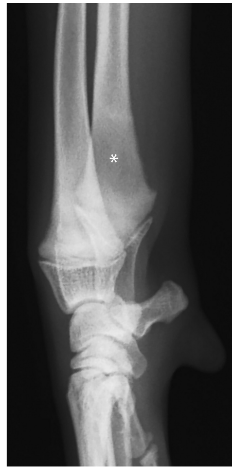
Figure 3 —Lateral radiographic image of the distal aspect the left antebrachium of the dog in Figures 1 and 2 after 18 days of antimicrobial treatment. An area of mildly low radiolucency (asterisk) is present in the distal metaphyseal region of the ulna. No visible cortical lysis or periosteal reaction can be identified. The distal physes of the radius and ulna appear normal.