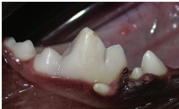
Figure 1 —Photograph of the right mandibular fourth premolar tooth and first and second molar teeth of a 5-month-old 27.2-kg (59.8-lb) Alaskan Malamute that was evaluated because of a suspected foreign body associated with the right mandibular first molar tooth.