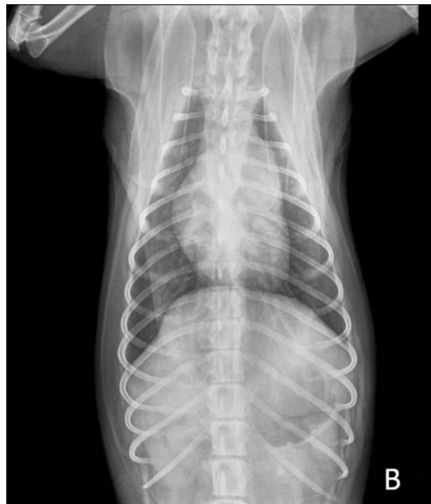
Figure 1—Right lateral (A) and dorsoventral (B) radiographic views of the thorax of a mixed-breed dog evaluated because of a single episode of collapse.