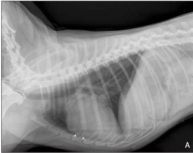
Figure 2—Same radiographic views as in Figure 1. On the lateral view (A), notice the increased sternal contact of the cardiac silhouette (arrowheads). On the dorsoventral view (B), the heart has a reversed letter D appearance (arrowheads) and there is a bulge in the 1 to 2 o'clock position (dotted line).