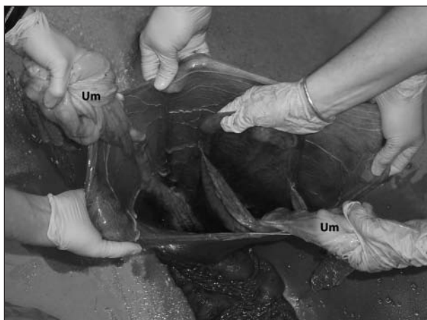
Figure 2—Placenta from monozygotic twins that were aborted at 10 months of gestation from recipient mare 1 in this report. The view is from the opening at the cervical star; notice that there are 2 allantoic sacs. The chorionic surface was continuous. Um = Umbilicus.

have ovulated a second follicle. The mare's uterus was flushed for embryo recovery on day 8 after ovulation, and 2 embryos were recovered. One embryo was located immediately and was classified as a normal 8-day blastocyst. The other embryo was located after 1 hour; this embryo was small and was thought to be either a morula or an unfertilized oocyte.