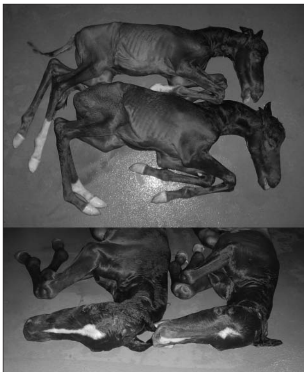
Figure 1—First set of monozygotic twin colts that were aborted at 10 months of gestation from recipient mare 1 of this report. Notice the differences in facial and limb markings between the colts.