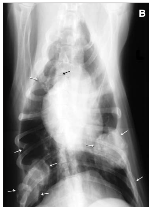
Figure 2—Same left lateral (A) and ventrodorsal (B) radiographic views as in Figure 1. Notice expansile osseous lesions (white arrows) originating from the sixth, seventh, and eighth ribs on the left side and the third, sixth, seventh, eighth, and ninth ribs on the right side of the thorax. A large lesion is evident at the level of the spinous processes at T2-T3, and a small lesion is evident at T7 (black arrows). Additional lesions are evident at the fifth, sixth, eighth, and ninth thoracic spinous processes (arrowheads).