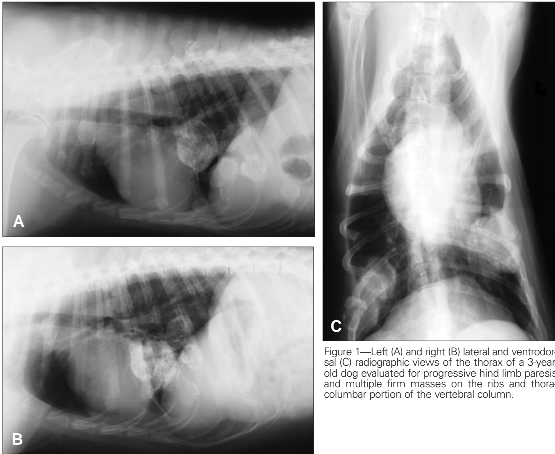
Figure 1—Left (A) and right (B) lateral and ventrodorsal (C) radiographic views of the thorax of a 3-year-old dog evaluated for progressive hind limb paresis and multiple firm masses on the ribs and thoracolumbar portion of the vertebral column.