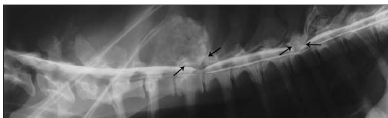
Figure 3—Lateral myelographic view of the thoracic portion of the vertebral column of the dog in Figure 1. Excessive osseous proliferation of the spinous processes with subsequent dorsal compression of the spinal cord is evident at T3-T4 and T7 (arrows).

Multiple expansile osseous lesions ranging in size from 3 to 5 cm are evident on multiple ribs (Figure 2). Additional expansile lesions are evident on the spinous processes of the thoracic vertebrae with the largest lesion seen at the level of the second and third thoracic vertebrae. Radiographic findings are compatible with a diagnosis of multiple cartilaginous exostoses (MCE).