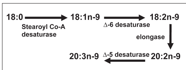
Figure 1—Pathway for synthesis of 20:3n-9 (ie, 5,8,11-eicosatrienoic acid) when low-fat diets devoid of the essential omega-6 and omega-3 fatty acids are fed to cats. There is accumulation of 22:3n-9 via desaturation and chain elongation of 18:1n-9 when suitable amounts of EFAs (ie, linoleic and \alpha -linolenic acids) are lacking in the diet. Elongase = Chain elongase.

When low-fat diets that are devoid of essential omega-6 and omega-3 fatty acids are fed, mammals will further elongate and desaturate 18:1n-9, which results in the production of 20:3n-9 (ie, 5,8,11-eicosatrienoic acid). Measurable quantities of the latter fatty acid are a hallmark of EFA deficiency (Figure 1), which leads to classical signs of this disorder, such as poor growth, scaly dermatoses, and scruffy hair as well as numerous