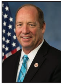
Dr. Ted Yoho

Dr. Schrader earned his DVM degree in 1977 from the University of Illinois and spent more than three decades as a farmer and veterinarian before winning a seat in Congress in 2008. He is a member of House committees and subcommittees on agriculture, small business, and research.