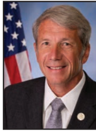
Dr. Kurt Schrader