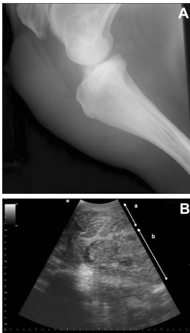
Figure 1—Diagnostic images obtained from a 6-year-old Holstein cow examined because of chronic lameness and swelling near the stifle joint of the left pelvic limb. A—Lateromedial radiographic view of the left stifle joint. There is marked thickening of the soft tissue cranial to the stifle joint and proximal to the tibia of uniform opacity. The thickening is well-defined proximally and more poorly defined distally. It is outside of the ligaments and adipose tissue of the stifle joint. No bony abnormalities are visible. B—Longitudinal ultrasonographic image of the mass (3.5-MHz curvilinear probe). The mass that is within the biceps femoris muscle is moderately heterogenic and visible lateral to the proximal aspect of the tibia and stifle joint. a = Normal skeletal muscle tissue. b = Mass within the skeletal muscle. Irregularly shaped pockets of fluid with a mixed echogenicity are visible within the mass.

consistent with a neoplasm or hematoma. Without sedation but following local infiltration of lidocaine with the cow in the standing position, multiple ultrasound-guided biopsy a specimens were obtained. More than 1 biopsy was performed because of the poor quality and hemorrhagic contents obtained. Cytologic examination of an impression smear of a biopsy specimen was suggestive of a sarcoma because of the presence of individual fusiform cells with ill-defined cytoplasmic borders, basophilic cytoplasm, and nuclei containing fine, granular chromatin with prominent nucleoli. There were some binucleated cells present as well. Histologic examination