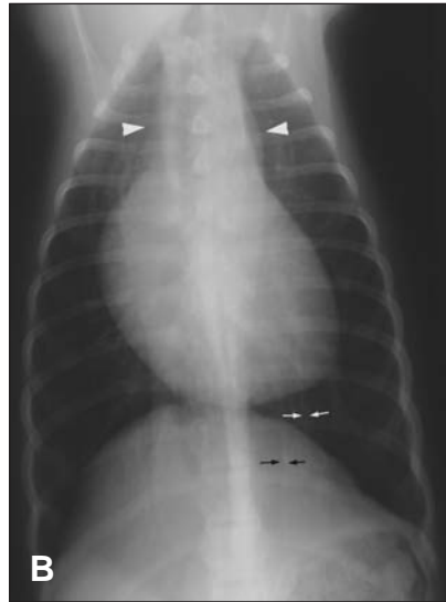
Figure 2—Same radiographic views as in Figure 1. On the lateral (A) radiographic view, notice loss of the cranial cardiac waist caused by an enlarged aortic arch (white arrows). Elevation of the trachea is caused by mild generalized cardiac enlargement and is accentuated by rotation. Increased width of the heart is evidence of right-sided heart enlargement. On the ventrodorsal view (B), increased width of the cranial mediastinum (arrowheads) is evident. Notice the small left caudal pulmonary artery (white arrows) and vein (black arrows).