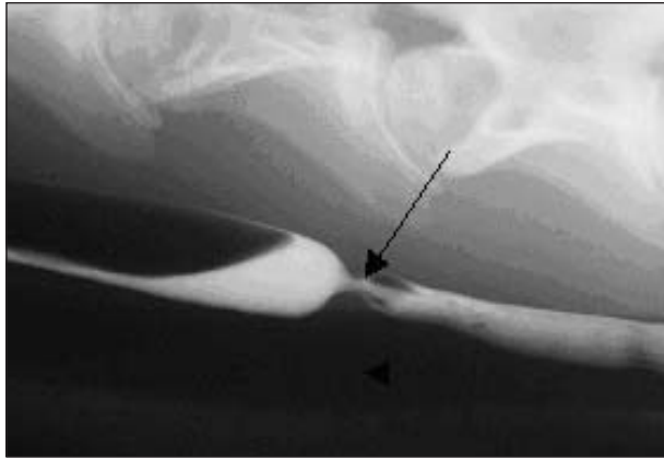
Figure 3—Same radiographic view as Figure 2. Contrast medium is seen filling the esophagus. A narrowed area (arrow) representing an esophageal stricture is seen in the mid-cervical region. There is dilatation of the esophagus proximal to the stricture. The trachea is also clearly visible (arrowhead).