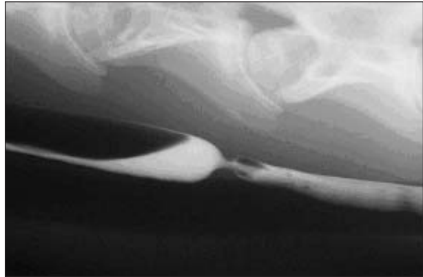
Figure 2—Contrast esophagogram, lateral view of the horse in Figure 1.